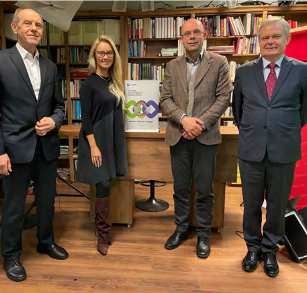
Prawica Rzeczypospolitej, Poland