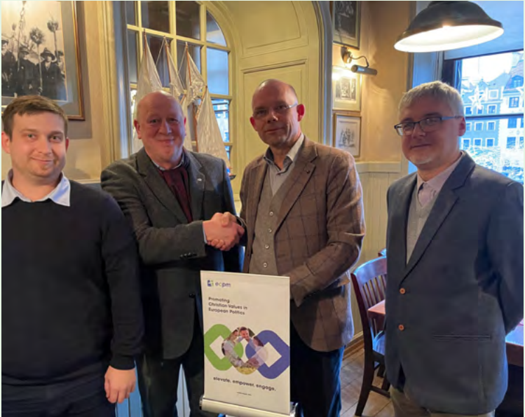
Unia Polityki Realnej, Poland